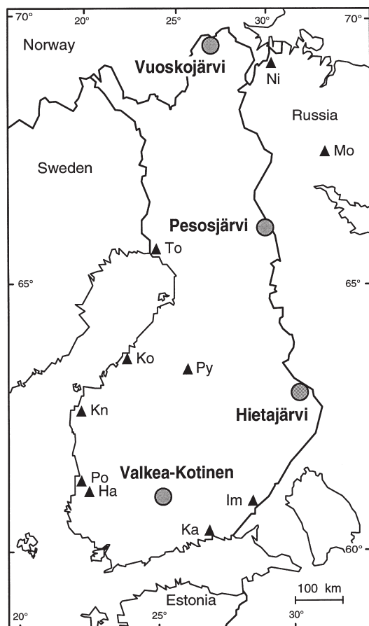
Fig. 1. Locations of IM catchments (circles) and some major point sources (triangles) for atmospheric heavy metal emissions. Ha = Harjavalta (Cu,Pb,Cd), Im = Imatra (Cr, Pb), Ka = Karhula (Cr), Kn = Korsnäs (Pb), Ko = Kokkola (Cd), Mo = Monchegorsk (Cu,Ni), Ni = Nickel (Ni), Po = Pori (Cu), Py = Pyhäsalmi mine (Zn,Cu), To = Tornio (Cr).

contain areas of forested upland, peatland and lake(s). A detailed description of the catchments is given in Bergström et al. (1995) but a brief description is given below.