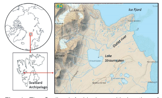
Fig. 1. The Svalbard Archipelago with location of Straumsjøen and its outlet river to the Ice Fjord. The detailed map has been copied from TopoSvalbard, with permission from Norwegian Polar Institute.

fish densities are high, and with subsequent reappearance when fish density declines, as observed in reservoirs in Norway with fluctuating brown trout and Arctic charr densities (Aass 1969).