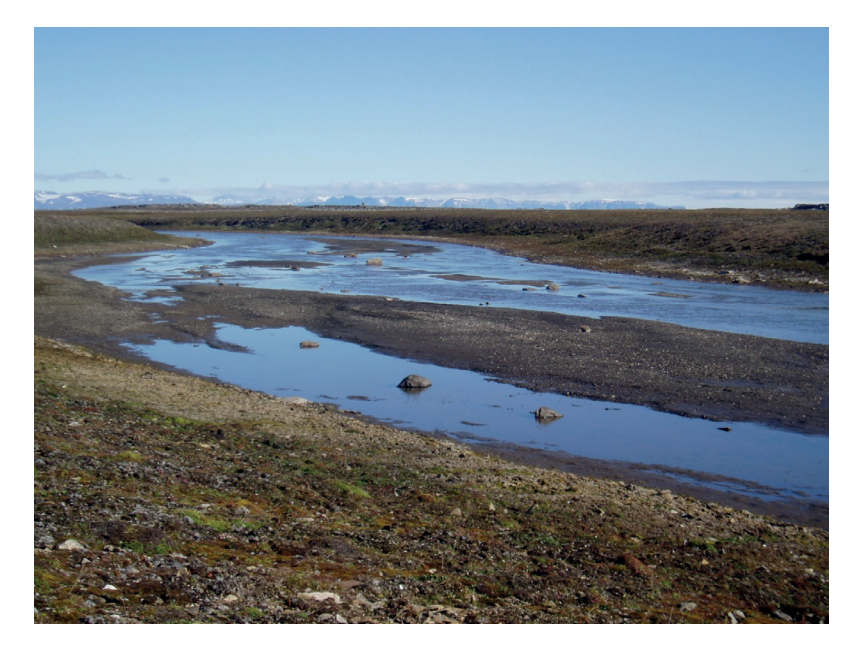
Fig. 2. Section of the outlet river from Straumsjøen. In the foreground, one of the many more or less closed pools in the riverbed at low discharge,

Olofsson (1918) recorded L. arcticus in ponds nearby Straumsjøen in 1910, and in August 2006 we observed high numbers of tadpole shrimp in ponds and their small outlet streams forming tributaries to the outlet river from Straumsjøen. Tadpole shrimps were also observed in isolated pools in the river itself during latter half of July and in August 2006. These pools were connected to the river after periods with rain.